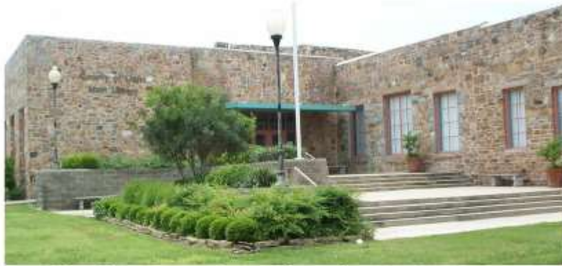
The Llano County Library is located at 102 E Haynie Street llano-library-system.net

The Llano Fine Art Guild & Gallery is Located at 503 Bessemer Avenue. Featuring the works of local Artists and Artisans llanofineartsguild.com