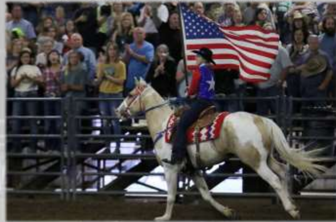
Barrel Racing, Mutton Bustin, Bull Riding, Team Roping, Bronc Riding Rodeo Action