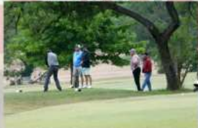
Crawfish Open Scramble