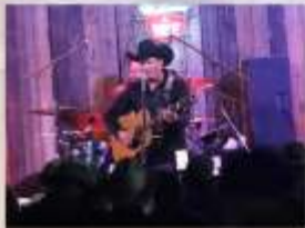
Live Music All Weekend