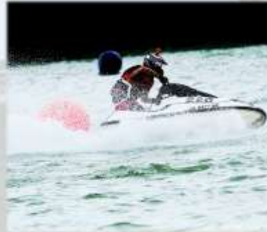
Jet Ski Races