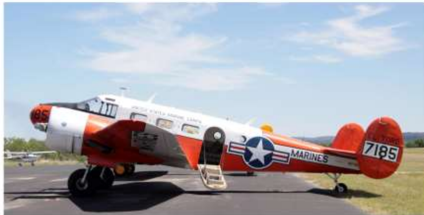
Llano Municipal Airport Our local airport is located 2 miles northeast of the city, on State Highway 16 (100 Evelyn Gould Drive). You can contact the Llano Municipal Airport at 325-247-5635. llanotx.com/edc/airport.htm