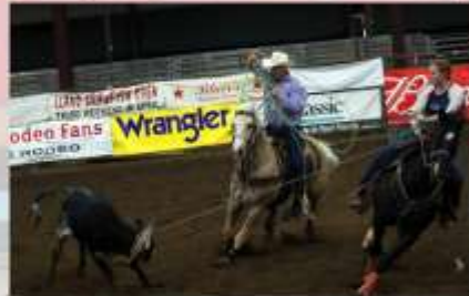
Crawfish Open Team Roping at The John L. Kuykendall Arena