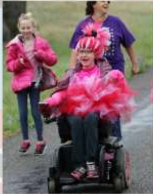
Llano Crawfish 5K